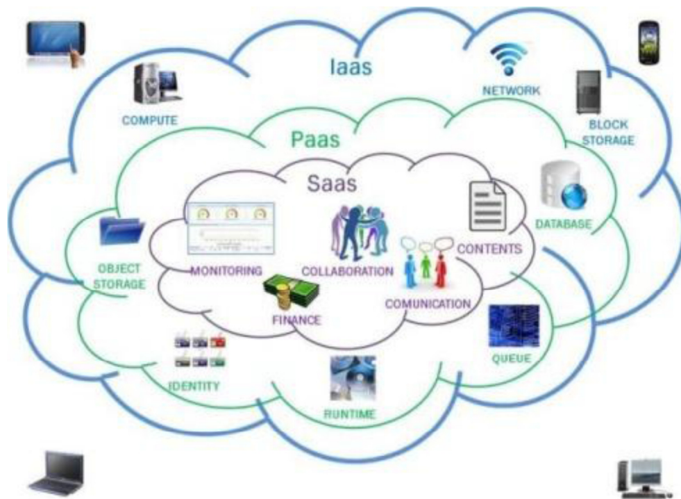
Figure 2. Cloud Computing Service Model

the mobile devices that can only require internet connection. Libraries now a day's vow to provide their